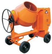
One Bag Concrete Mixer