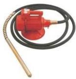
Electric Concrete Vibrator