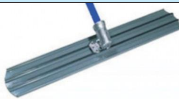
Bull Float (Concrete Floater)