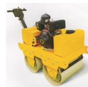
Double Drum Roller