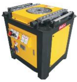
Bar Bending Machine