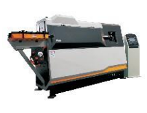
Automatic Rebar Stirrup Machine