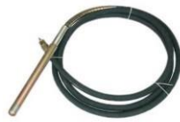
All Vibrator Needles