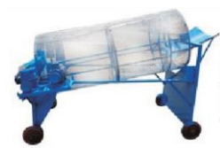
Sand Screening Machine