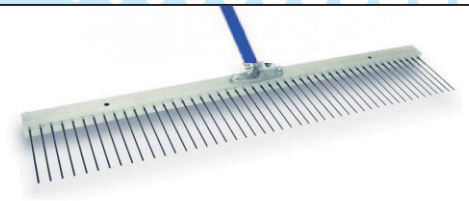
Concrete Texture Comb