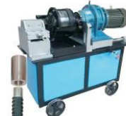
Rebar Threading Machine