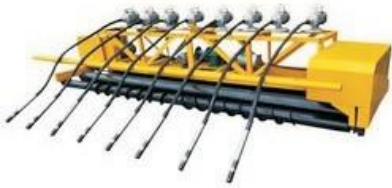
Fixed Form Concrete Road Paver