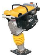
Tamping Rammer Petrol or Electric