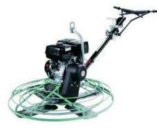
Power Trowel Petrol or Electric