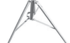
Scaffolding Tripod Stand