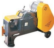
Bar Cutting Machine