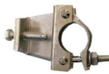
I Beam Clamp