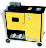
Stirrup Ring Making Machine upto 20mm