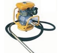
Concrete Vibrator With Needle