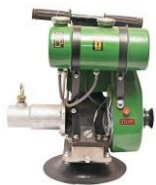
Petrol Kerosene Vibrator