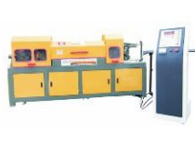
Bar Decoiling Machine