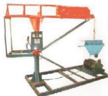
Jib Crane 500 kg Capacity