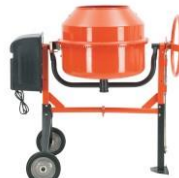
Portable Baby Concrete Mixer