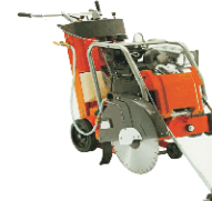
Concrete Groove Cutting Machine