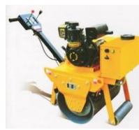
Single Drum Vibratory Roller