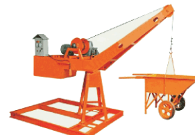
Monkey Hoist 200 Kg Capacity