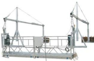
Suspended Platform / Facade Access System