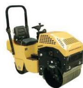
Ride on Roller