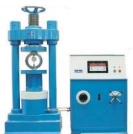
Concrete Testing Machine