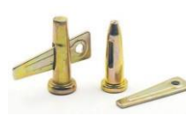
Mivan / Bullet Pin