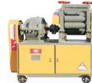
Scrap Bar Straightening Machine