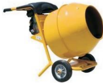
Half Bag Concrete Mixer